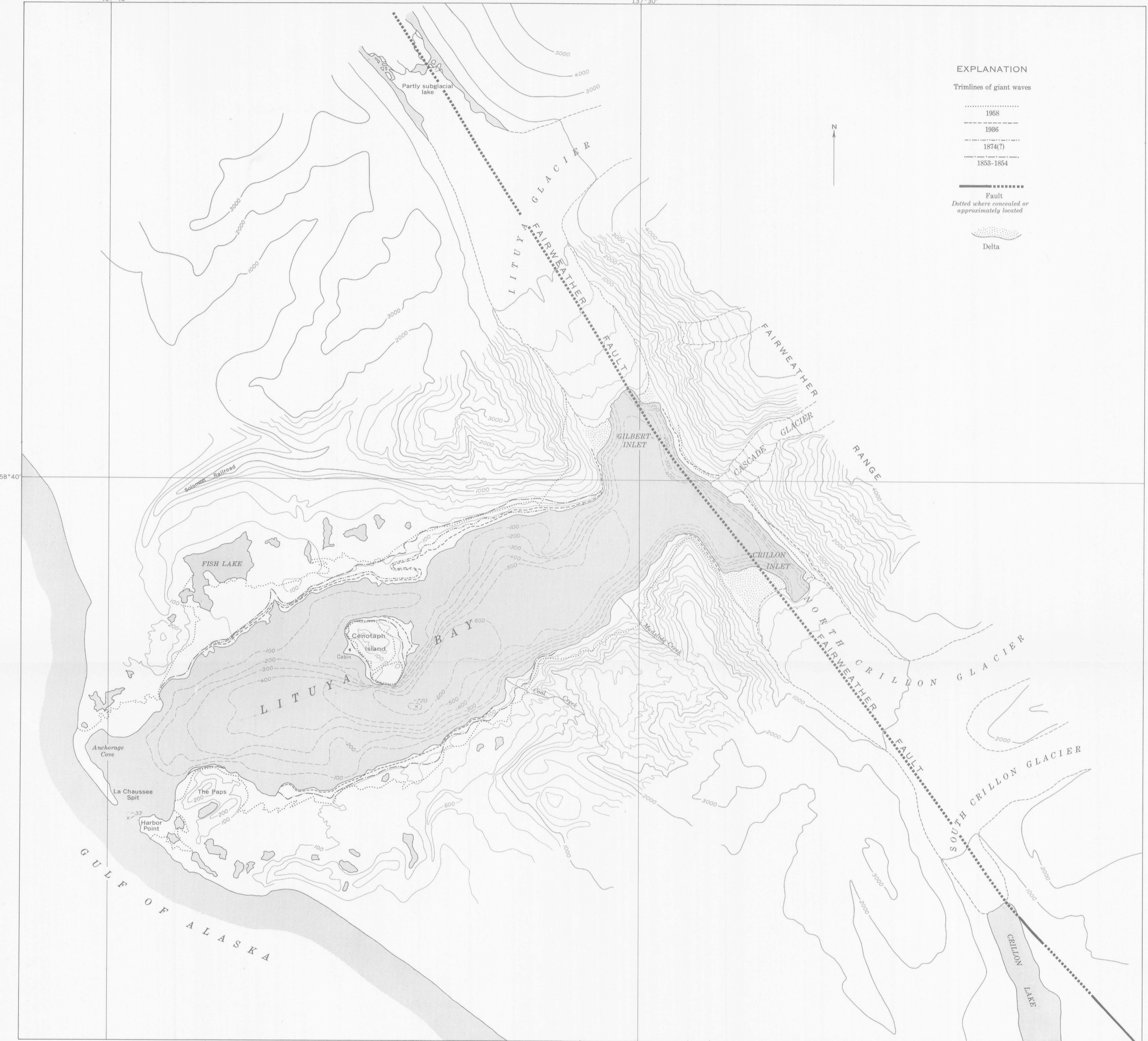
MAP OF LITUYA BAY AND ADJOINING AREA, SHOWING SUBAERIAL AND SUBMARINE TOPOGRAPHY, TRACE OF FAIRWEATHER FAULT AND TRIMLINES OF KNOWN GIANT WAVES AS MAPPED IN THE FIELD AND FROM PHOTOGRAPHS